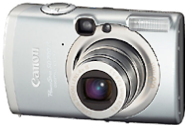
Canon PowerShot SD700 IS Digital Elph ( note the “IS”)