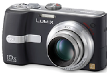
Panasonic Lumix DMC-TZ1