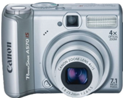
Canon PowerShot A570 IS ( note the “IS”)