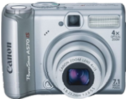
Canon PowerShot A570 IS ( note the “IS”)