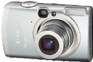
Canon PowerShot SD700 IS Digital Elph ( note the “IS”)