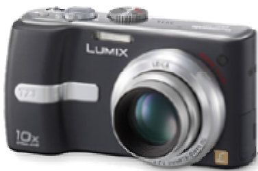
Panasonic Lumix DMC-TZ1